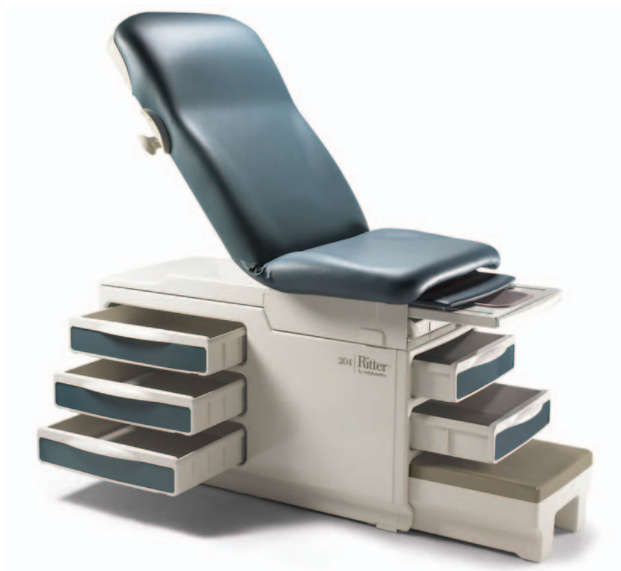
Fig. 1 — An example of Midmark's new, sturdier examination table introduced in 2005.

Manufacturer banks on robotic resistance welding to provide a cost-effective, aesthetically pleasing, and strengthened cabinet assembly