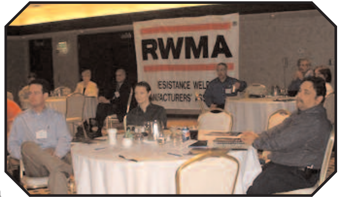
Full member meeting

I wanted to take this opportunity to thank everyone involved for making our Spring Meeting in Grand Rapids a great success! The discussions, meetings and speakers all were very beneficial. Our gala reception and dinner on Thursday night was great. It was wonderful to see all of the past members and officers that made the RWMA a success for all of these years. To reminisce, reacquaint and even meet new friends. I want to thank Roman Manufacturing for their help in hosting the meeting in Grand Rapids. As I'm sure you know the RWMA entered into a new era during our Spring Meeting. During our Full Member Meeting on Friday morning April 1 st , the membership voted overwhelmingly to merge with the American Welding Society and to combine our activities and operations as of June 1, 2005.