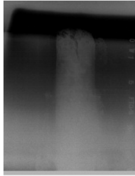
Fig. 5 — Radiograph of a defective weld.