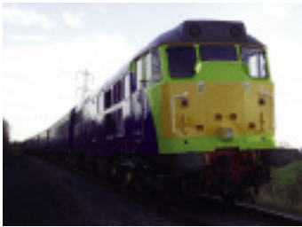
Fig. 8 — High-speed ultrasonic test vehicle.

ically for weld inspection, but it must be stated that none of the techniques currently in use inspect within the cast material of the weld. They are all used to determine the quality of the fusion faces.