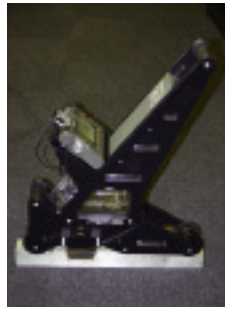
Fig. 7 — Ultrasonic walking stick.