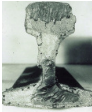
Fig. 1 — An example of incomplete fusion.

The task of the inspector is to detect and classify any defects,