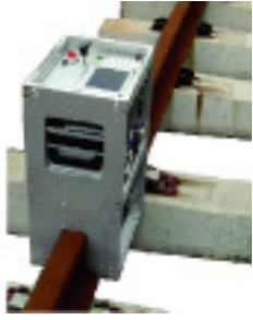
Fig. 6 — The GULS equipment for weld inspection.