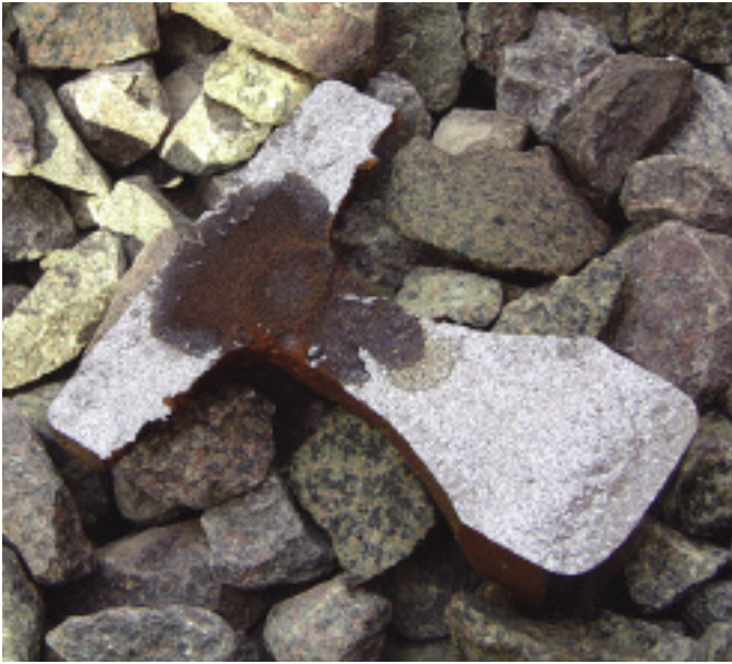
Fig. 3 — An example of a hot tear.

Another common problem is porosity, which occurs because the material that the mold is made of, normally sand, is moist when the weld is made and generates gas bubbles as the molten steel solidifies — Fig. 2.