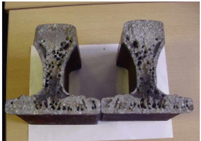
Fig. 2 — An example of porosity.

preferably at the time at which the weld is made. A great deal of statistical evidence shows that a weld is most likely to fail shortly after it was formed, or not at all.