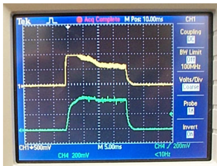
Figure 3. Experimental results: supply voltage (top line) and current (bottom line) in current control mode.

Many welding quality issues can be related to type and quality of power supplied. This power supply provides the flexibility to explore whether constant power, current, voltage or some other intermediary control signal provides the most consistent welds.